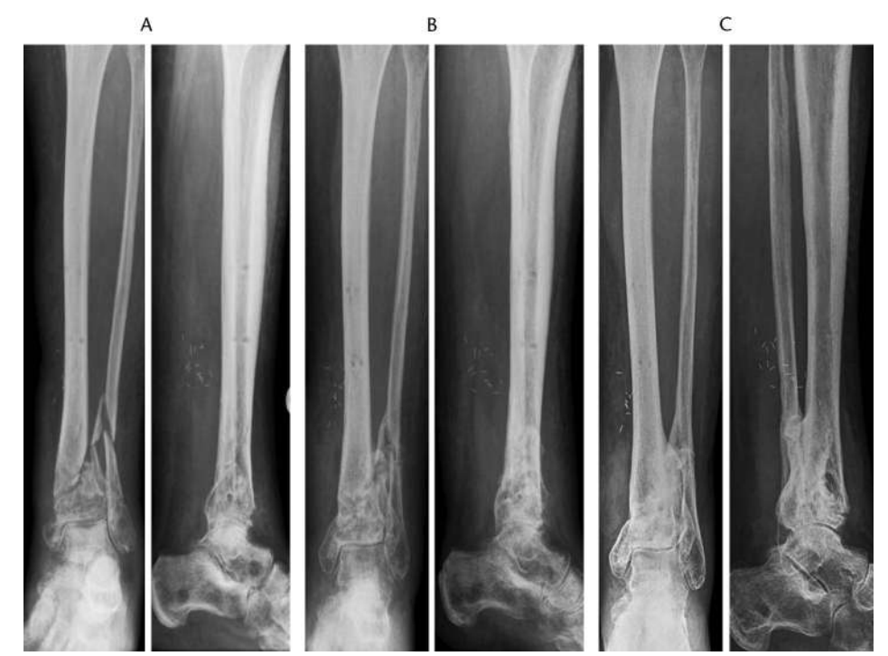
FIGURE 2. A 54-year-old diabetic woman with atrophic nonunion after a fall. Treated with one session of extracorporeal shock wave therapy and casting for 8 weeks. (A) Anterior-posterior (AP) and lateral views at 6 months. (B) AP and lateral views 3 months after treatment. (C) AP and lateral views 6 months after treatment.

were significantly associated with complete bone healing (Table 2). The significantly lower likelihood of fracture healing in patients requiring multiple (more than one) shock wave treatments versus a single treatment may be attributable to the