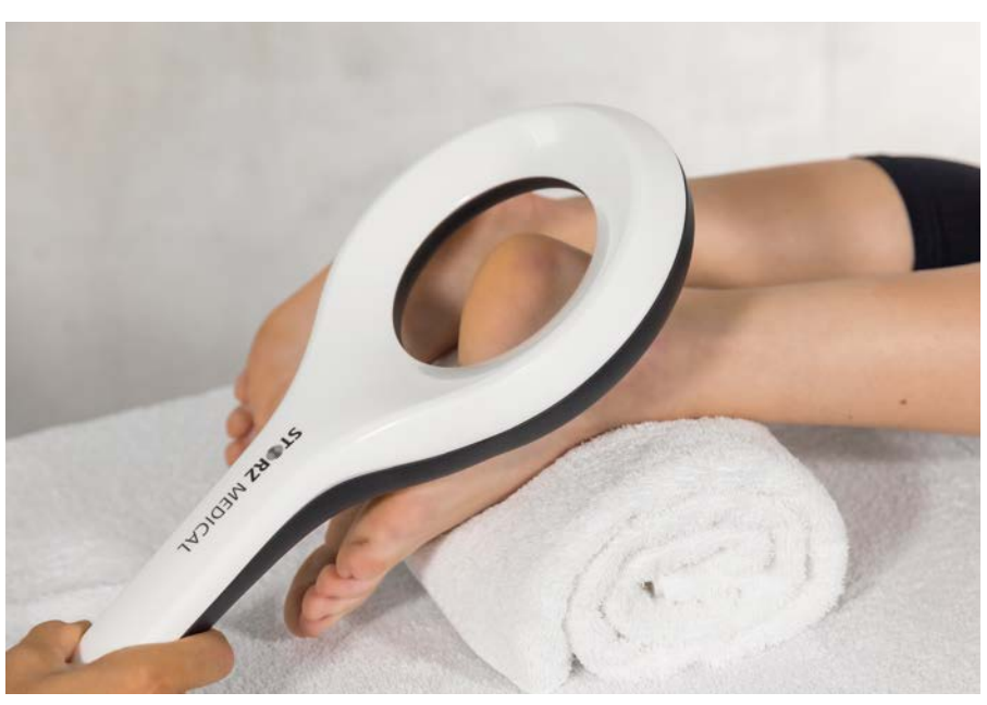
Extracorporeal Magnetotransduction Therapy generates a high-energy magnetic field.

ESWT is aimed at local inflammatory diseases such as enthesiopathy, tendon attachment disease or pseudarthroses, EMTT® takes a more regenerative approach to degeneration, i.e. joint diseases or degenerative muscle tendon diseases. Even in the overlapping indication areas, such as enthesiopathy of the rotator cuff, it will probably even be possible to achieve additive effects by taking a different approach if both forms of therapy are applied in parallel. In basic research, it has been possible to establish in cell-biological terms that magnetotransduction therapy has a very good effect on inflammatory processes, e.g. interleukin systems. Inflammatory promoters in the interleukin system are reduced, while anti-inflammatory reactions seem to be favoured. Here it could be shown