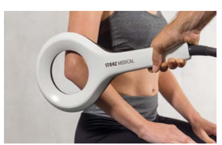
EMTT® treatment of the elbow

In the course of EMTT®, painful areas of the body are treated with high-energy magnetic pulses,