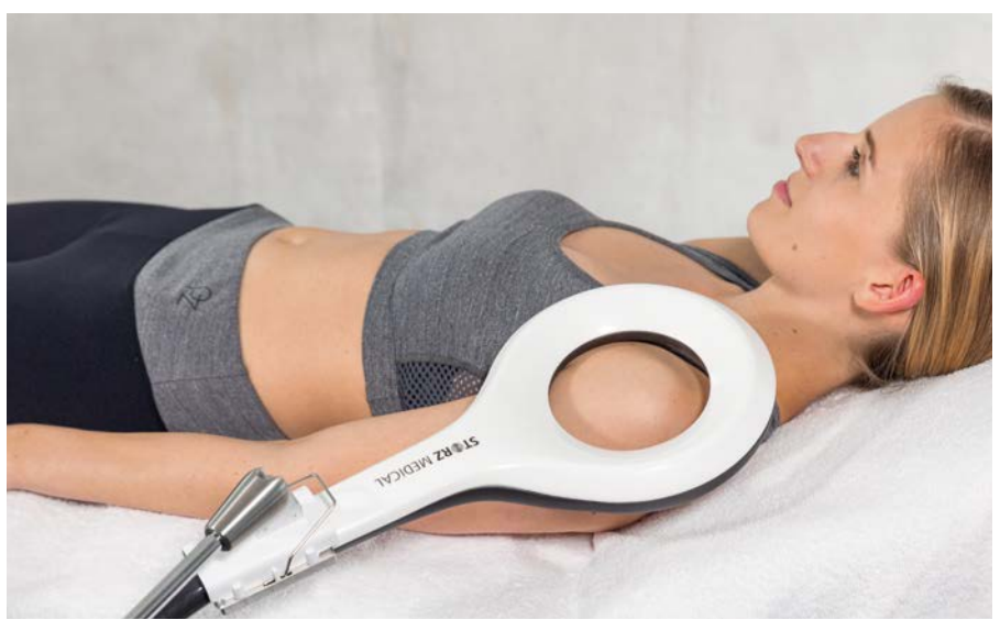
Fatigue-free EMTT® treatment of the shoulder thanks to flexible holding arm

Extracorporeal Magnetotransduction Therapy (EMTT®) with MAGNETOLITH® is a non-invasive treatment solution that opens up new possibilities in regeneration and rehabilitation. The areas of application include chronic diseases of the musculoskeletal system such as lower back pain, tendinopathies of the rotator cuff or Achilles tendon. Due to its properties, EMTT® is also ideally suited as a supplement to extracorporeal shock wave therapy (ESWT), as is shown in current study data<sup>5</sup>.