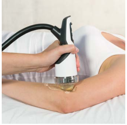
ESWT is used for local inflammatory diseases.

EMTT® can be used to bear down on the soft tissue and inflammatory components.